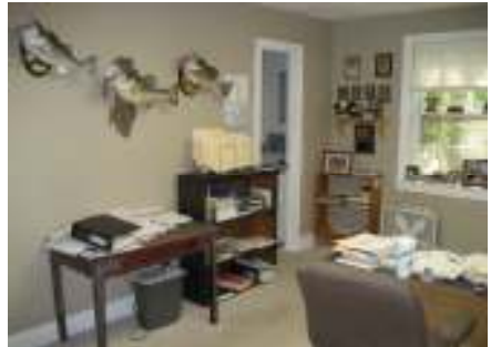
Downstairs Bedrooms # 1 and 2 with "Jack & Jill" Bathrooms

Separate Apartment has 3 rd Bedroom, Full Bath, Kitchen and Parlor with separate Outside Door: