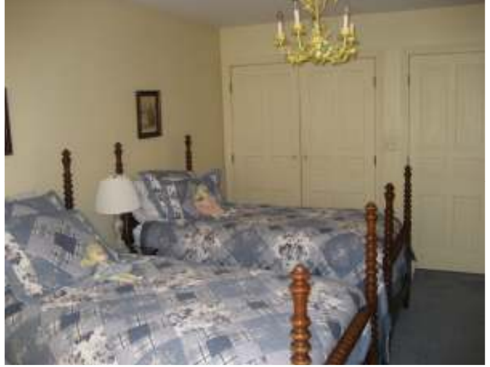
Bedroom #2 on main level

Downstairs - 3 Bedrooms, "Apartment", Fireplace, and lots of storage