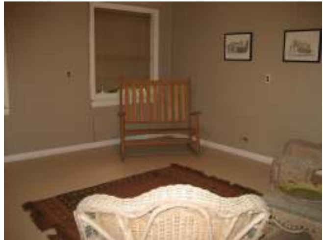
3 rd Downstairs Bedroom w/ Full Bath in Apartment

Main level also includes the main Kitchen, Breakfast Room, Formal Dining Room, Den & Screened Porch: