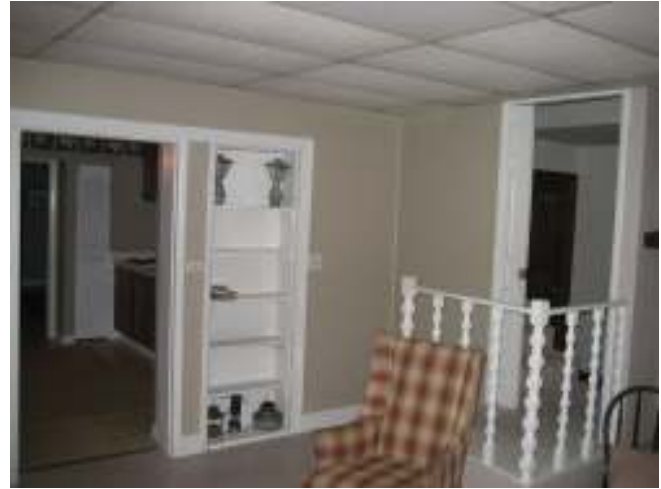
Downstairs Apartment Den w/ Fireplace