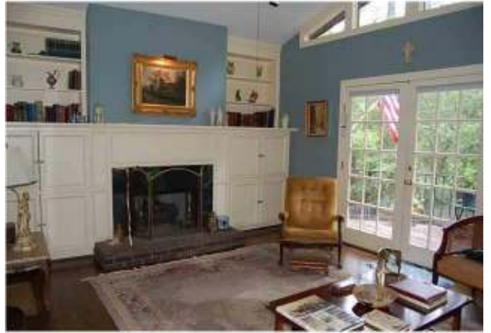
Den with step-down floor and high ceiling