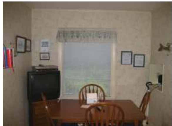
Kitchen and Breakfast Room