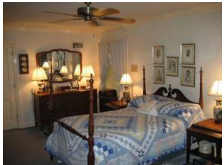
Master Bedroom on main level (14' x 12')