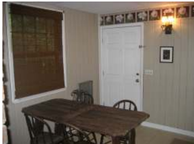
Apartment Kitchen Downstairs