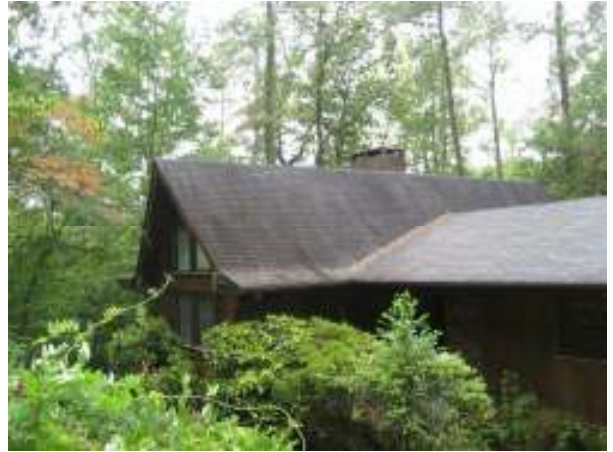
20Ft. Cathedral Ceiling Living Room